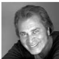
Engelbert Humperdinck "After the Lovin'" Show Tropicana Casino Atlantic City, New Jersey

For a special day of entertainment and gaming excitement travel to Atlantic City, New Jersey to see a matinee show starring Engelbert Humperdinck at the Tropicana Casino . Romance serves as the core of Engelbert's music and lasting success. The reigning "Rex of Romance" pours his mellow voice over each note. He has received four Grammy nominations, a Golden Globe for Entertainer of the Year and a star on the Hollywood Walk of Fame. His most memorable hits are "After the Lovin'," "The Last Waltz," "Spanish Eyes," and "Release Me". Before the show enjoy a visit to the Casino where you will receive a $25.00 free slot play and a buffet lunch compliments of the Casino upon arrival. Try your luck, enjoying some time gaming and hopefully experience the thrill of winning. A fast food stop will be made on the return trip home. (L)