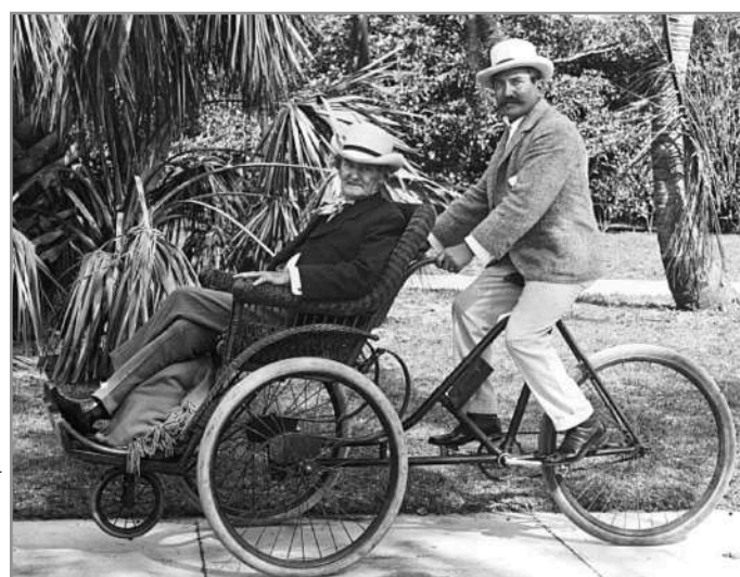
Palm Beach News

The 1821 poorhouse was razed in 1972. Affordable housing for seniors is now on the 11-acre property, part of the Lombard Trust.