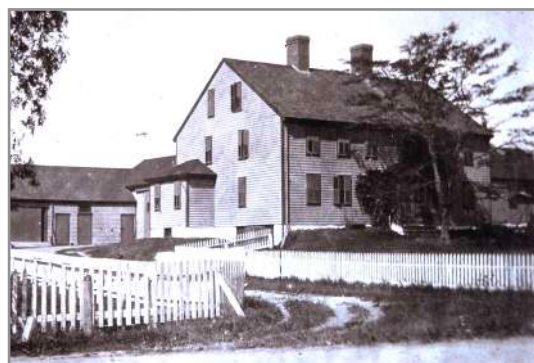
Whelden Memorial Library